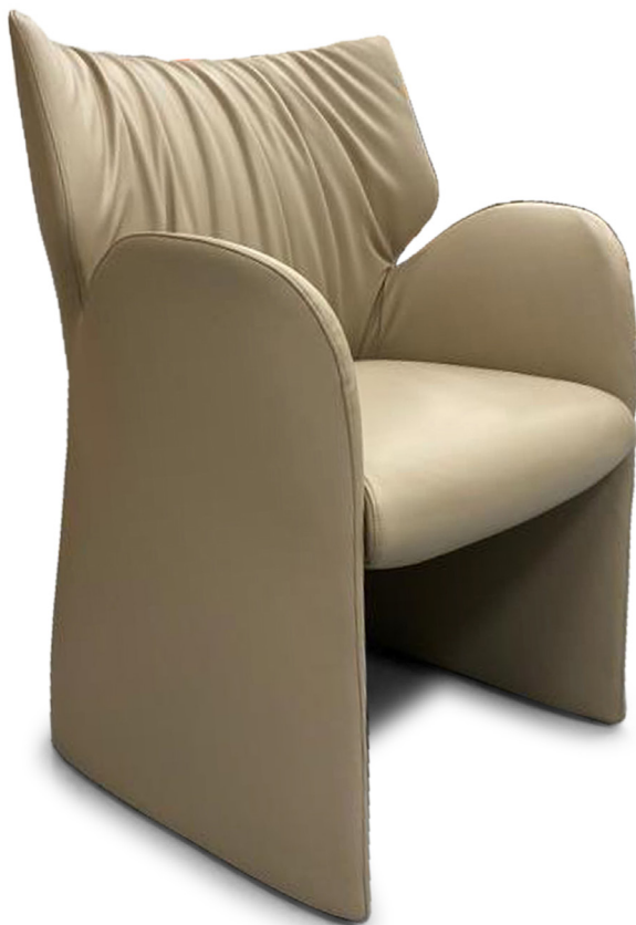
■ CH240032400 (draft image)

ALL PICTURES SHOWN ARE FOR ILLUSTRATIVE PURPOSE ONLY. ACTUAL PRODUCT MAY VARY DUE TO PRODUCT ENHANCEMENT.