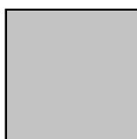
Glossy White Chalk