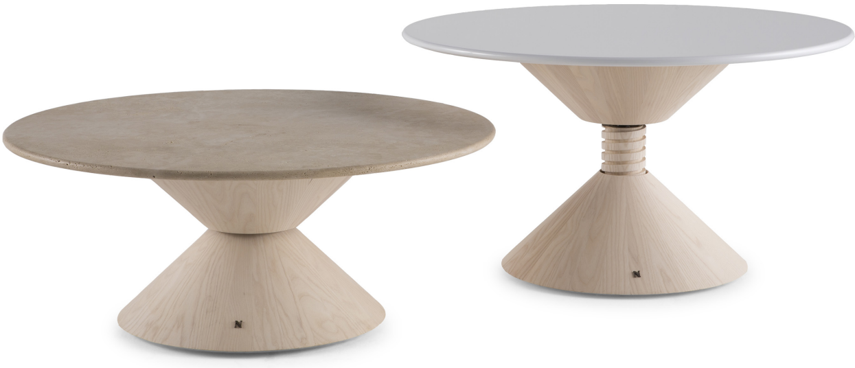
■ T876001XNA + T876002XNA