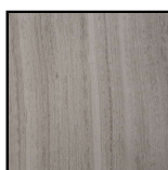
ATHENS SILVER CREAM