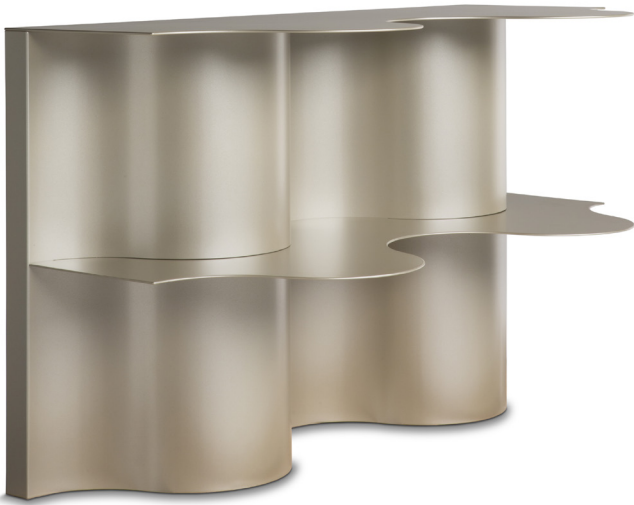
■ H844002XNA (100 x 46 x H61 cm)