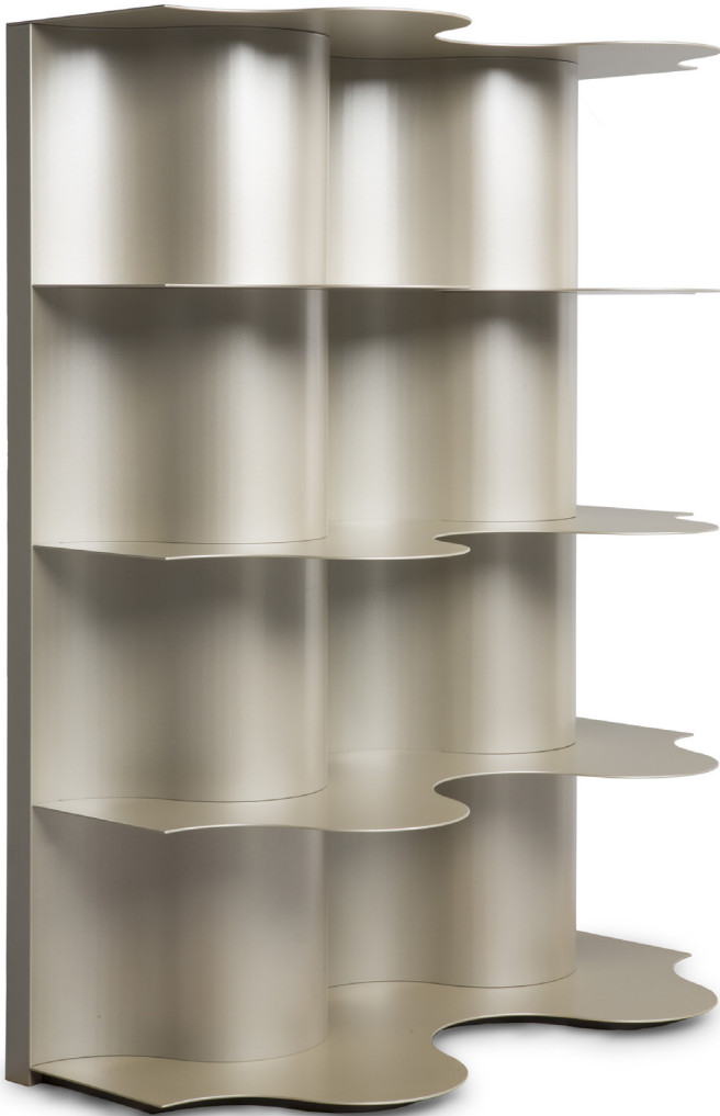
■ H844001XNA (100 x 46 x H124 cm)