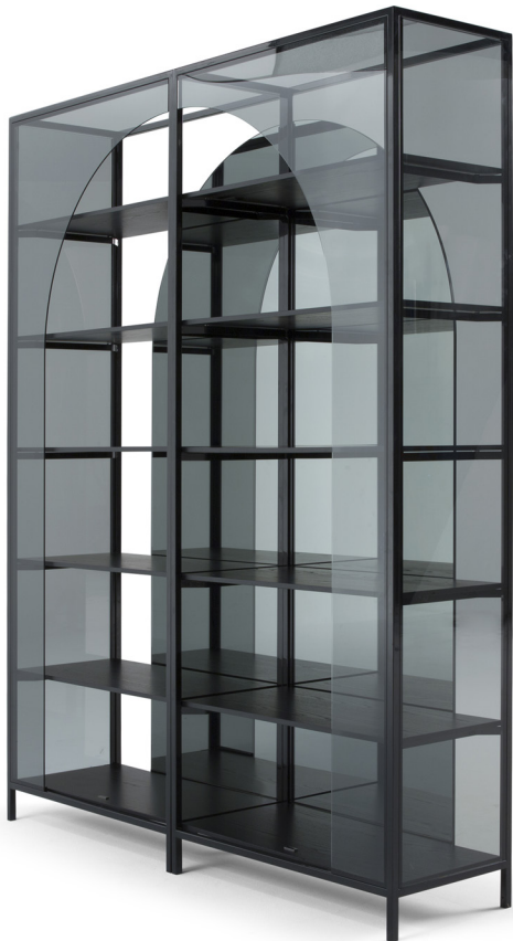
■ H00802X (left side) + H00801X (right side)