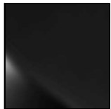
Black gloss chrome