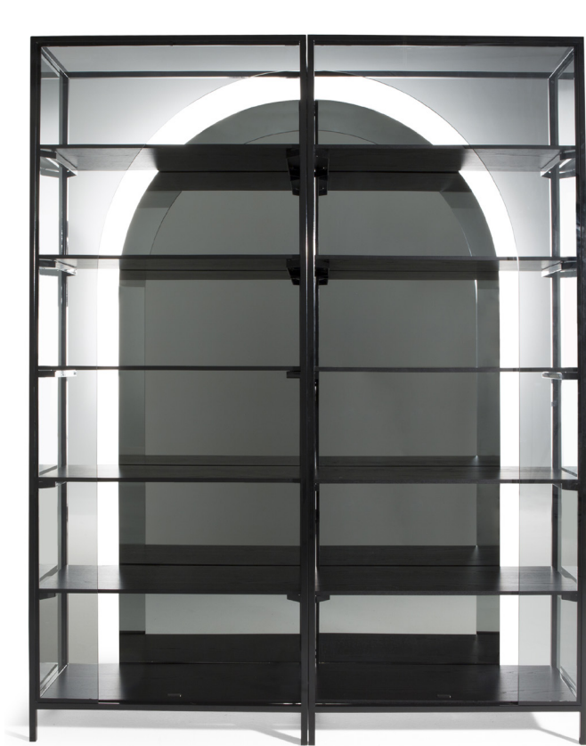
■ H00802X (left side) + H00801X (right side)