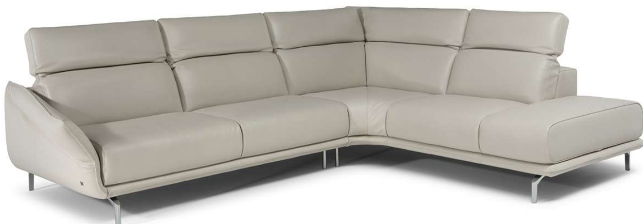
■ Vers. 018+481