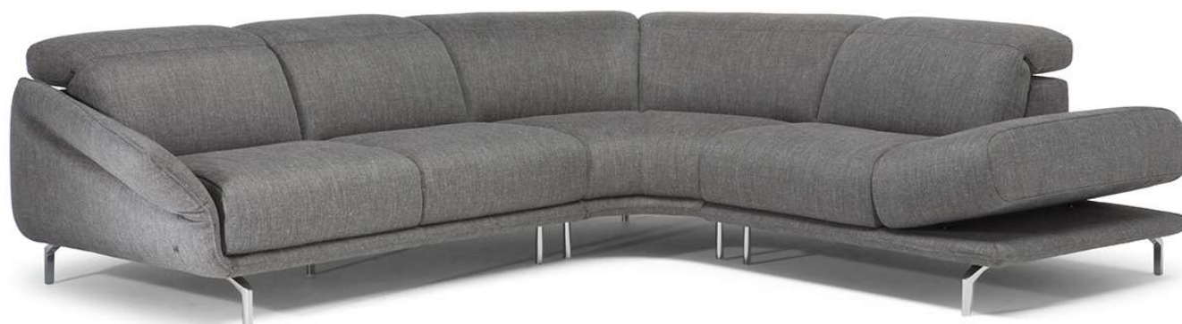
■ Vers. 016+029+073