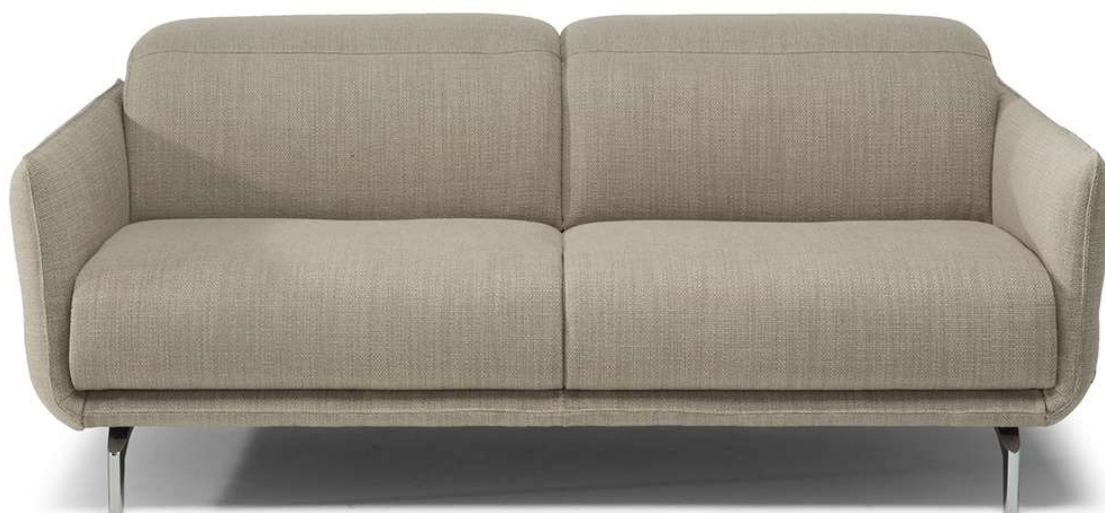
■ Vers. 009