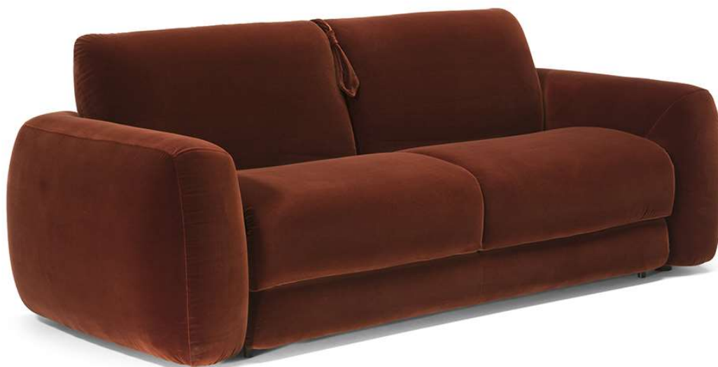
■ Vers. 101