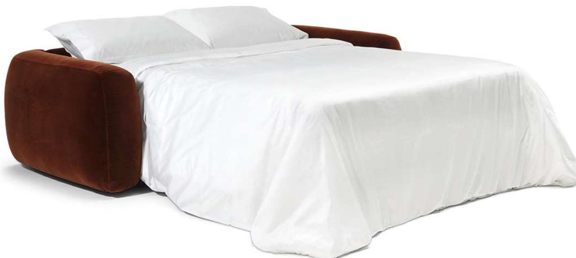
■ Vers. 101