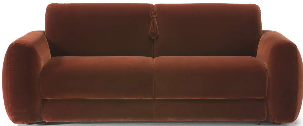
■ Vers. 101