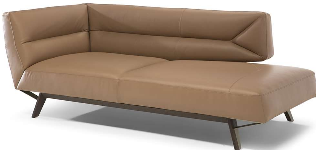
■ Vers. 586