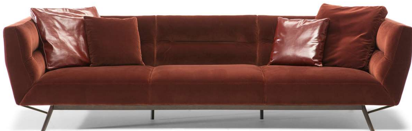
■ Vers. 064+109+109+152+152