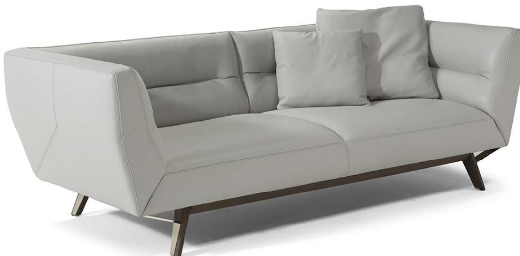
■ Vers. 009+109+152