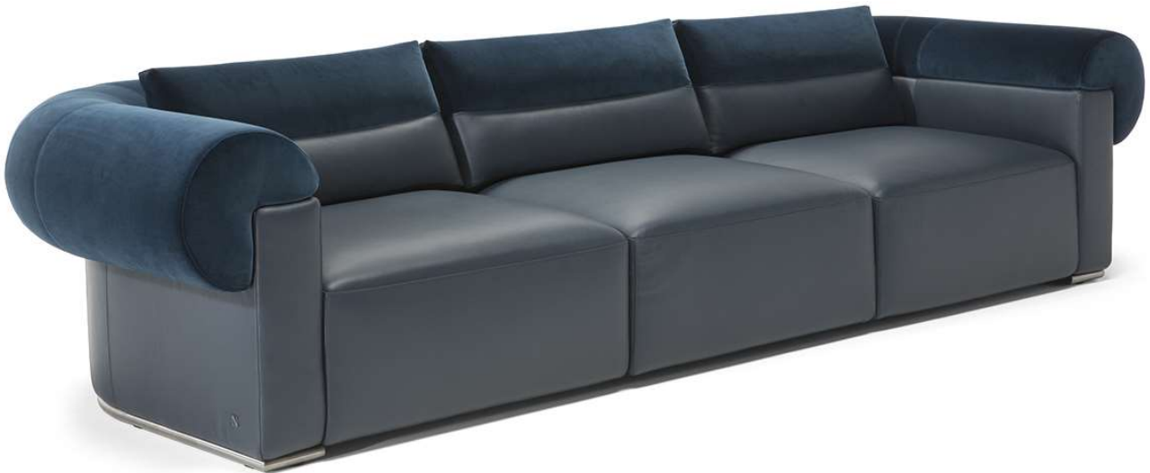
■ Vers. 272+291+274