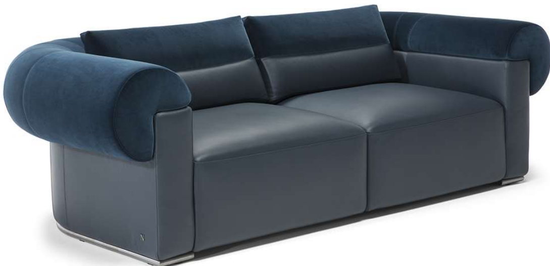
■ Vers. 272+274