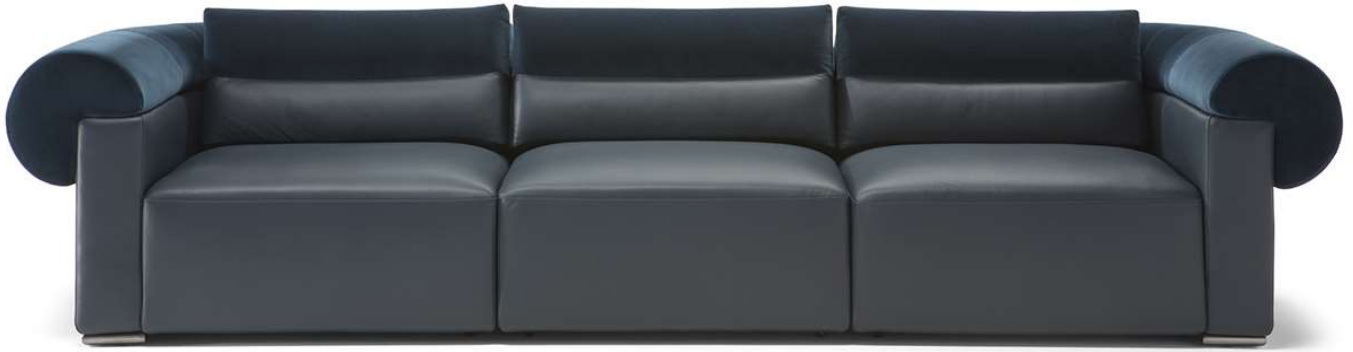
■ Vers. 272+291+274