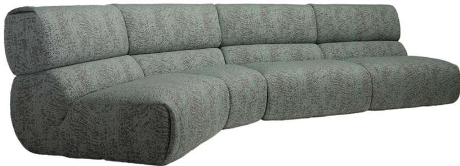
■ Vers. 291+045+291+291