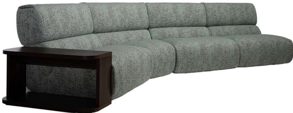
■ Vers. 291+045+291+291