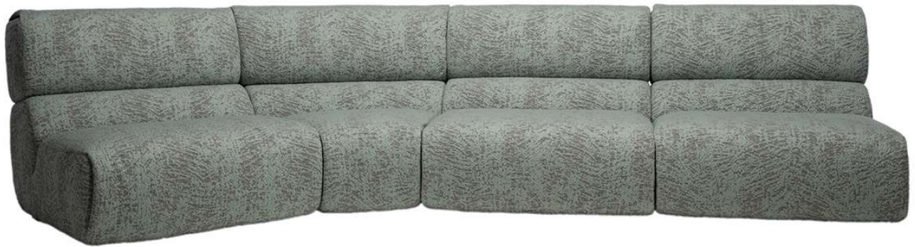
■ Vers. 291+045+291+291