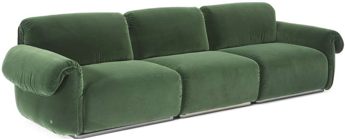
■ Vers. 272+291+274