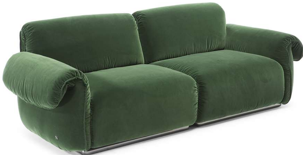
■ Vers. 272+274