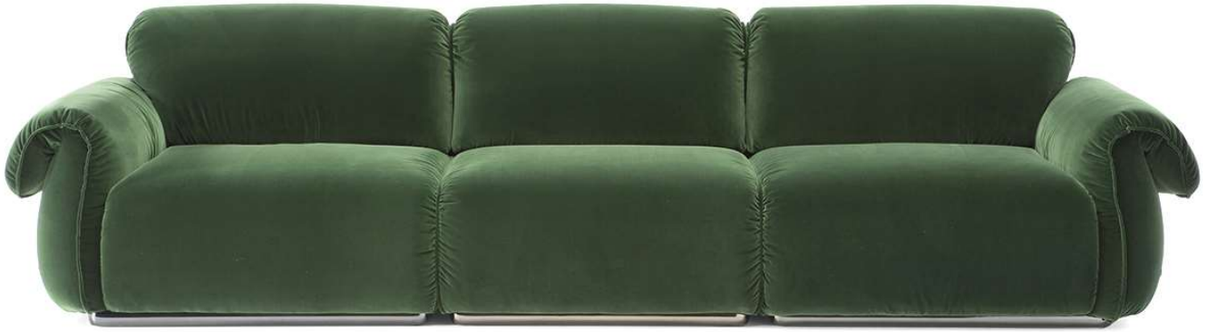
■ Vers. 272+291+274