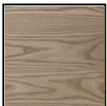
Ash Wood/Tobacco/Ch ampagne