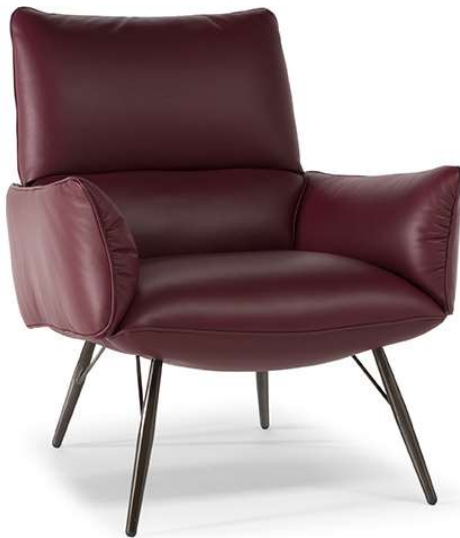
■ Vers. 003