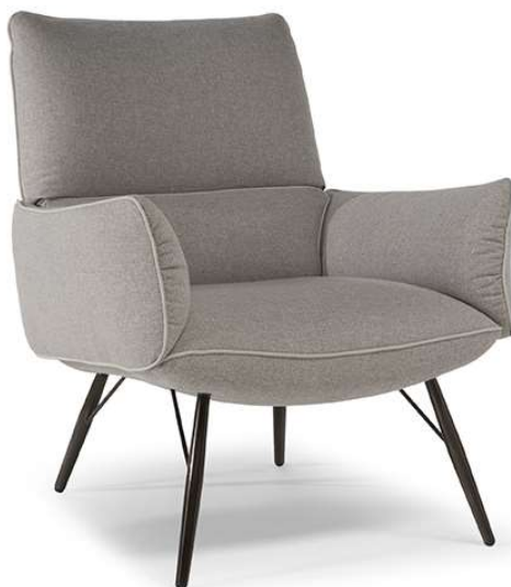
■ Vers. 003