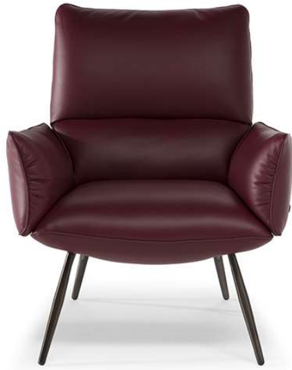
■ Vers. 003