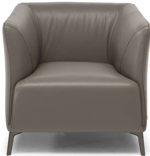
■ Vers. 003