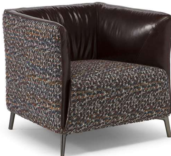
■ Vers. 003