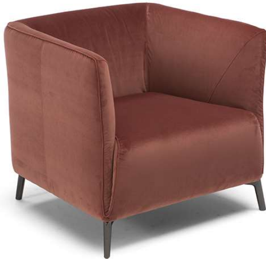
■ Vers. 003