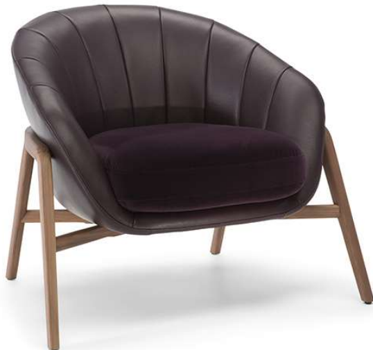
■ Vers. 003