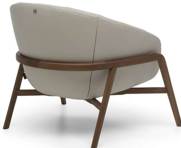
■ Vers. 003