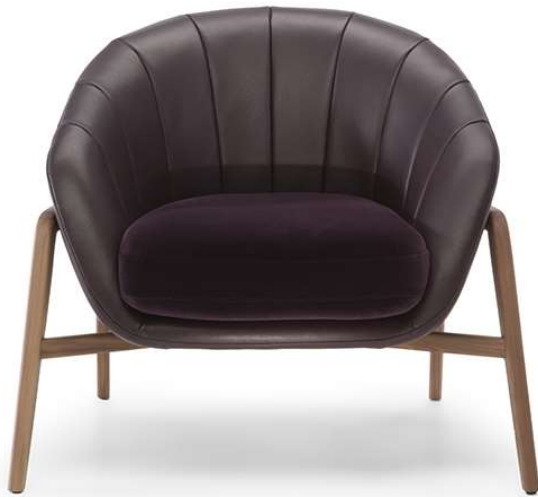
■ Vers. 003