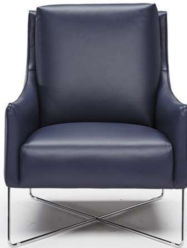
■ Vers. 003