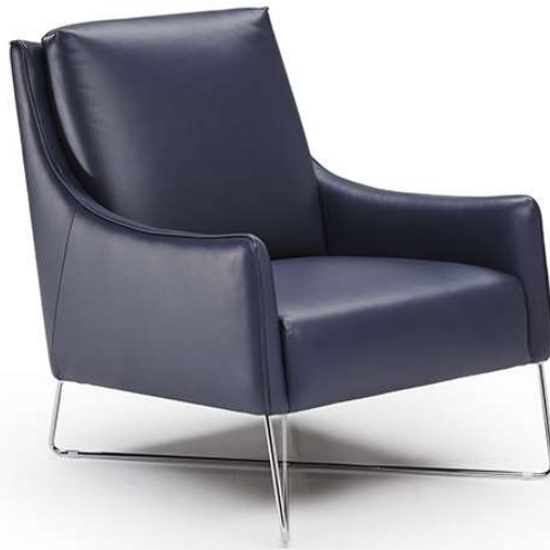
■ Vers. 003