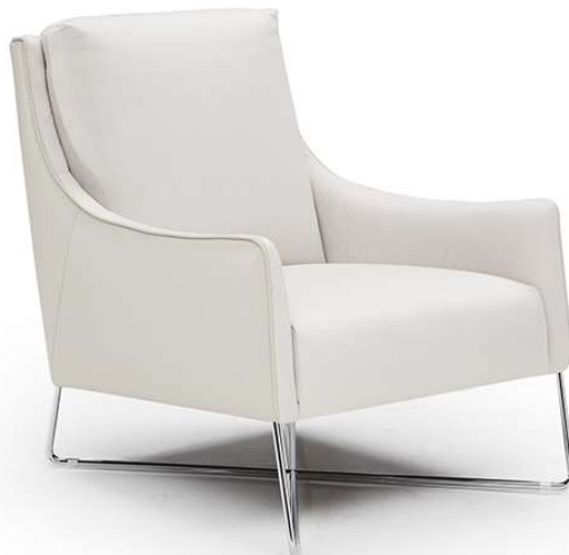
■ Vers. 003