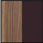
Walnut & Wine