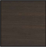
Smoked Oak Termocotto