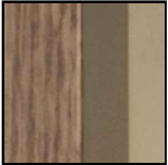
Glossy Champagne/Ash Wood Tobacco

55cm x 170cm H 74cm 21,65" x 66,93" H 29,13"