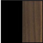
GLOSSY BLACK CHROME - EUCALIPTO WOOD