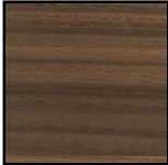
EUCALIPTUS - GLOSSY BRICK