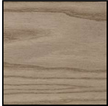
Ash Wood/Tobacco/Ch ampagne