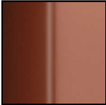
BRIQ GLOSSY LACQUER