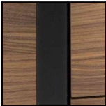
Walnut/Glossy Black Chrome