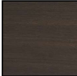
Smoked Oak Termocotto