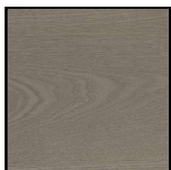
Ash wood tobacco