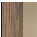
Glossy Champagne/Ash Wood Tobacco