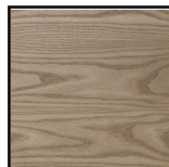
Ash Wood/Tobacco/Ch ampagne