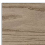
Ash Wood/Tobacco/Ch ampagne