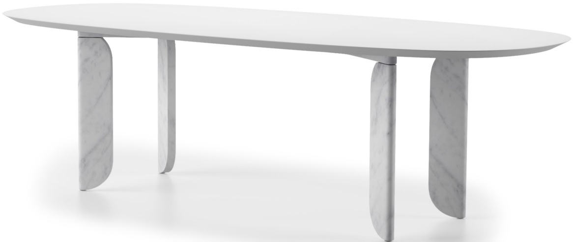
■ T873003XNA (draft image)