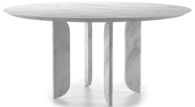
■ T873001XNA (draft image)