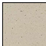
LECCE BRUSHED STONE