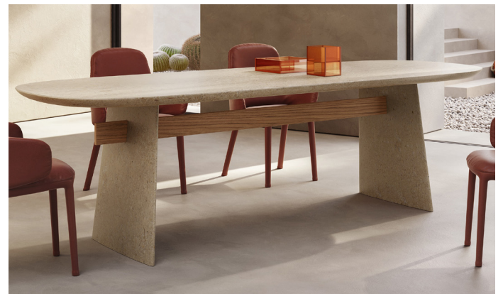
■ Q070007XNA (draft image)