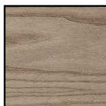
Ash Wood/Tobacco/Ch ampagne